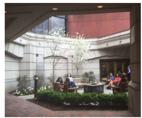
PAA Members Network Among the Blossoms

94% of the respondents rated their PAA 2016 experience as excellent or good. Most cited the high quality of research and the opportunity to meet with colleagues and friends as the most compelling reasons to attend.